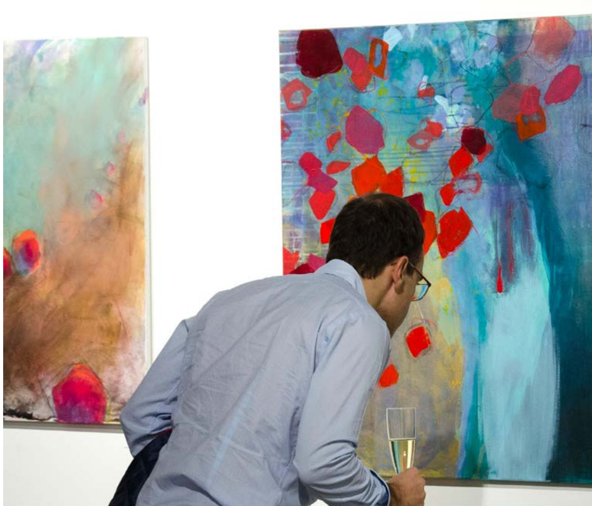
frontofbicycle Gallery: #BraswellArt Exhibition - Basel, CH